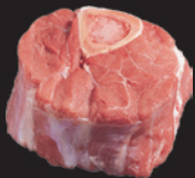
IMPS/NAMP 1337 Veal Osso Buco, Hindshank