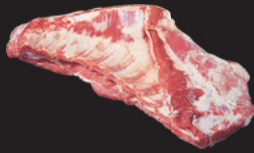
IMPS/NAMP 313 Veal Breast