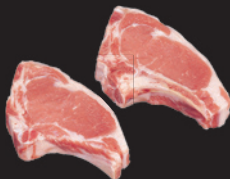
IMPS/NAMP 1306 Veal Rack, Rib Chops, 7 Rib