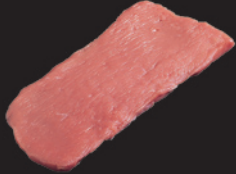
IMPS/NAMP 1336 Veal Cutlets, Boneless