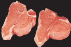
IMPS/NAMP 1332 Veal Loin Chops