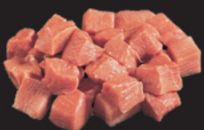
IMPS/NAMP 395 Veal for Stewing

Slow thawing prevents small ice crystals from thawing and refreezing into large crystals that cause further cell damage and moisture loss. In fact, thawing too rapidly at higher temperatures can actually undo the benefits of quick freezing.